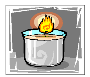
May their memory be for a blessing...