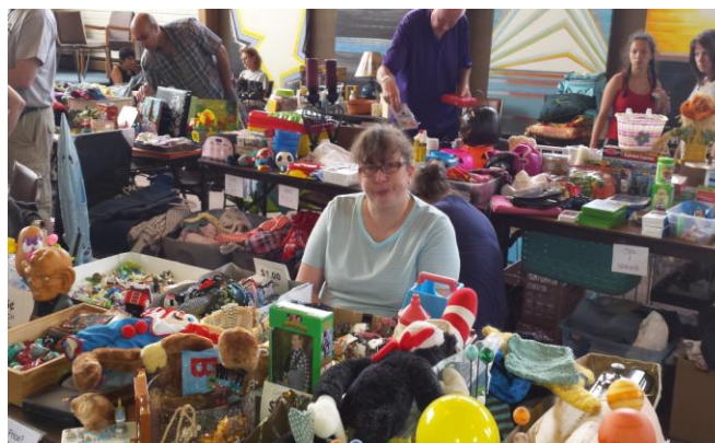
Flea Market Success